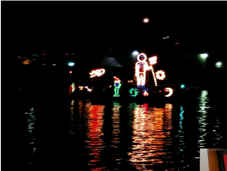
Astarte, decorated in an outer space theme.

Two TASS boats were decorated by the Girl Scouts for the Kemah Christmas Boat parade this year. The Girl Scouts won several awards, including the Mayor's Award for California Dreaming.